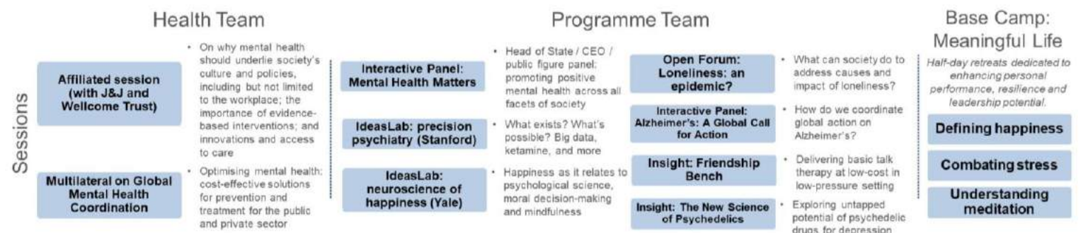
A graphic showing the main mental health events to be held at the World Economic Forum Annual Meeting

The World Bank has been issuing a number of new mental health papers and blogs recently, including a new paper on mental health in Nigeria . With their main focus for 2019 being on Universal Health Coverage, they are highlighting the vital need to integrate treatment and care services for mental health disorders into accessible service delivery and financial protection programs, along with psychosocial support mechanisms. See the World Bank Mental Health pages here for more information and to keep updated on the latest work.